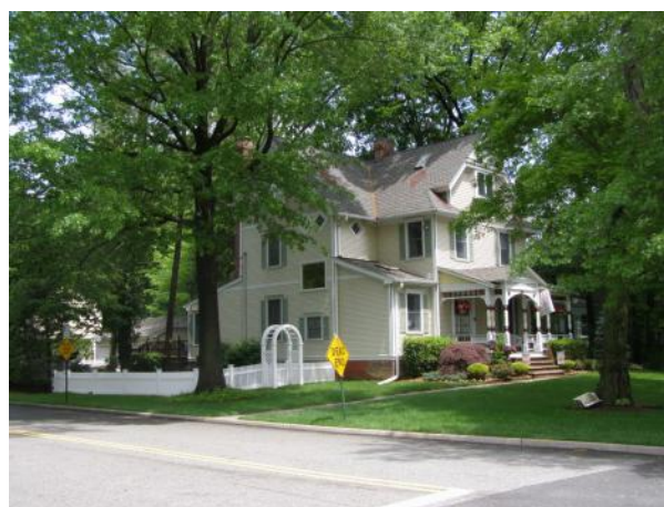
The Chapin home at 515 Oradell Avenue in 2011.