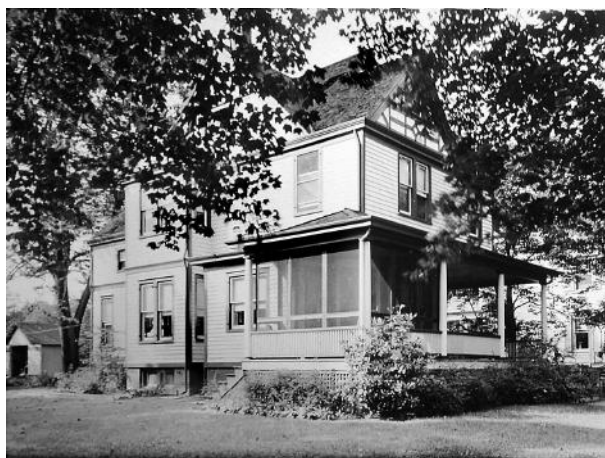
The Chapin home at 515 Oradell Avenue in 1933.