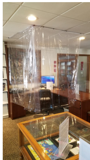
Protection for Reference Desk for Reopening During Coronavirus